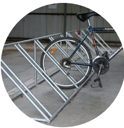
"Comb" or "Toast" Racks

Short-term options - great for trips to the park, grocery store, or other day trip destinations!