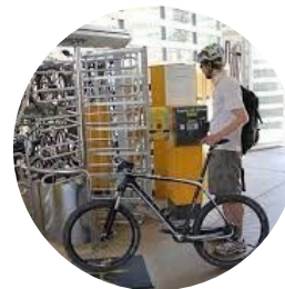
Secure Parking Areas