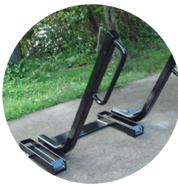
Wheel Well or "Stanford" Racks