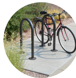
Inverted "U" or "A" Racks