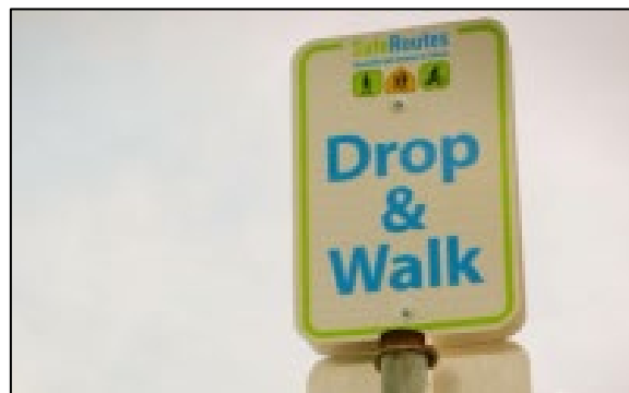
Figure 2: The City of Roseville's Safe Routes to School program established "Drop & Walk" locations to encourage students to participate in the walking school bus, even if they live too far away to walk from their home.