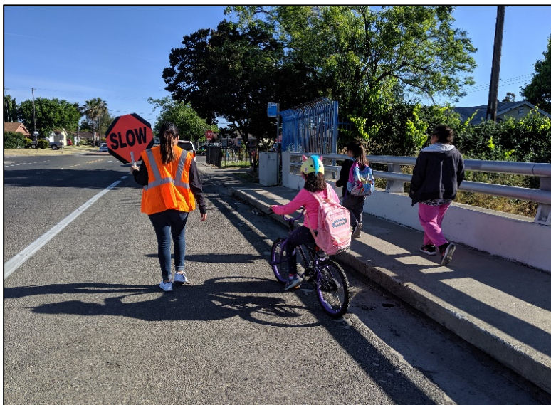
Figure 4: Students from Nicholas Elementary walk, bike, and roll with their Walking School Bus Leader.

Nicholas Elementary developed meeting locations that were convenient and nearby student homes and scheduled the Walking School Bus to occur on the same days as monthly parent meetings. Nicholas Elementary also offered incentives for both students and parents to join the walking school bus and for parents to join the parent meetings afterward. The school saw both its attendance for students and parents increase.