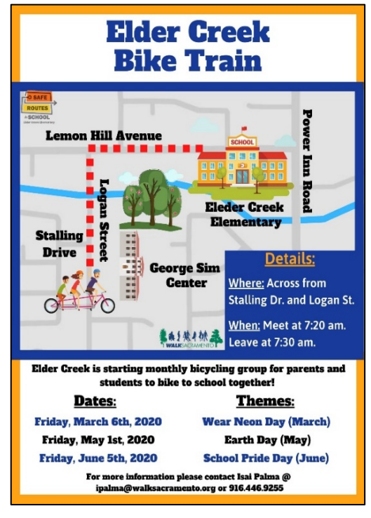
Figure 4: Example of a Bike Train Route