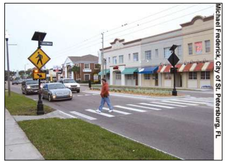
An example of a rapid flashing beacon and crossing

Create a safer crossing at 58th Street and Fruitridge Road south of West Campus. A pedestrian activated signal should be strongly considered, with appropriate crosswalk markings and signage.