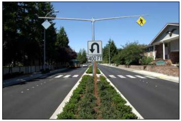
This image is an example of a good pedestrian median. It is not on the Fruitridge or Stockton corridor.

Strongly consider a pedestrian median on Fruitridge Road near 53<sup>rd</sup> Street due to the high number of pedestrian crossings at that location. Strongly consider more medians for safer pedestrian crossings generally on Fruitridge Road and Stockton Blvd.