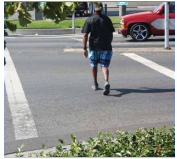
A pedestrian treks across the Fruitridge/Stockton intersection.