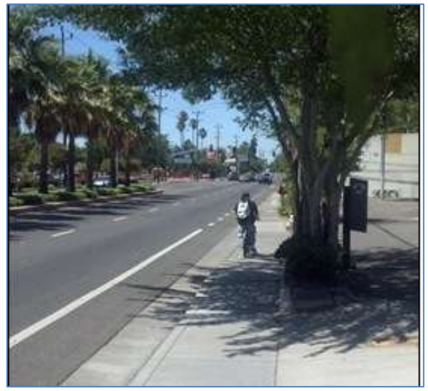
A traveler finds limited shade on Stockton Blvd.

Add more trees and shade generally on Fruitridge Road and Stockton Blvd for the safety and comfort of the many pedestrians walking in the sun. Work with local business owners to add shade trees to their property along sidewalks.