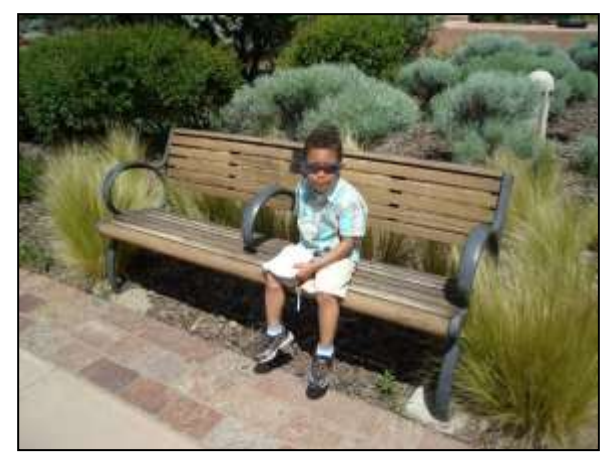
The bench in the image is an example of a common standard which allows comfortable sitting but no sleeping due to the arm rest in the middle of the bench.

Provide more shaded facilities for pedestrians to sit and rest along the street, and more garbage bins.