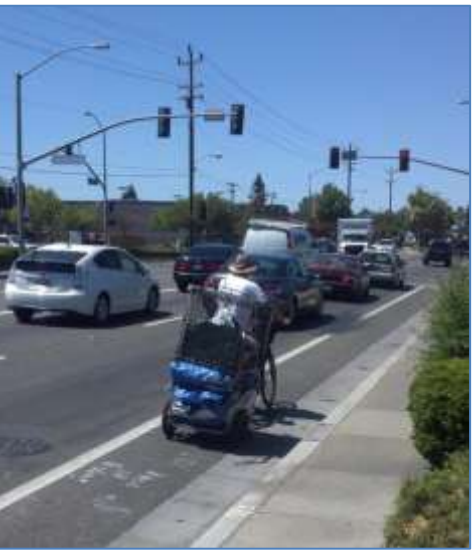
A bicycle rider moves his goods along Stockton Blvd. near Lawrence Drive