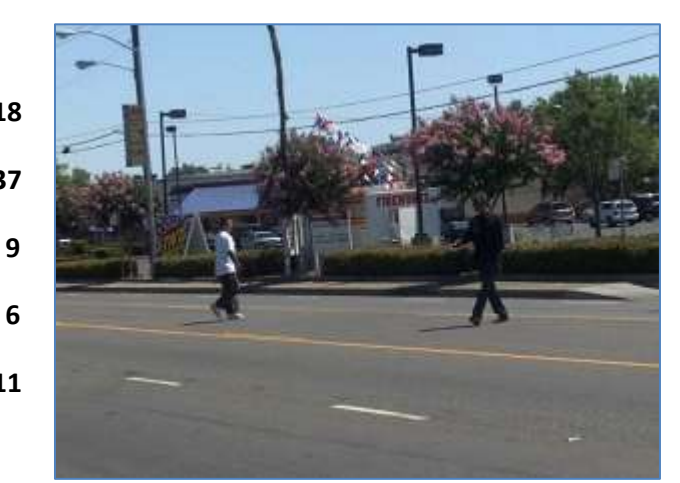
Two mid-block crossings on Stockton Blvd near the Kmart store