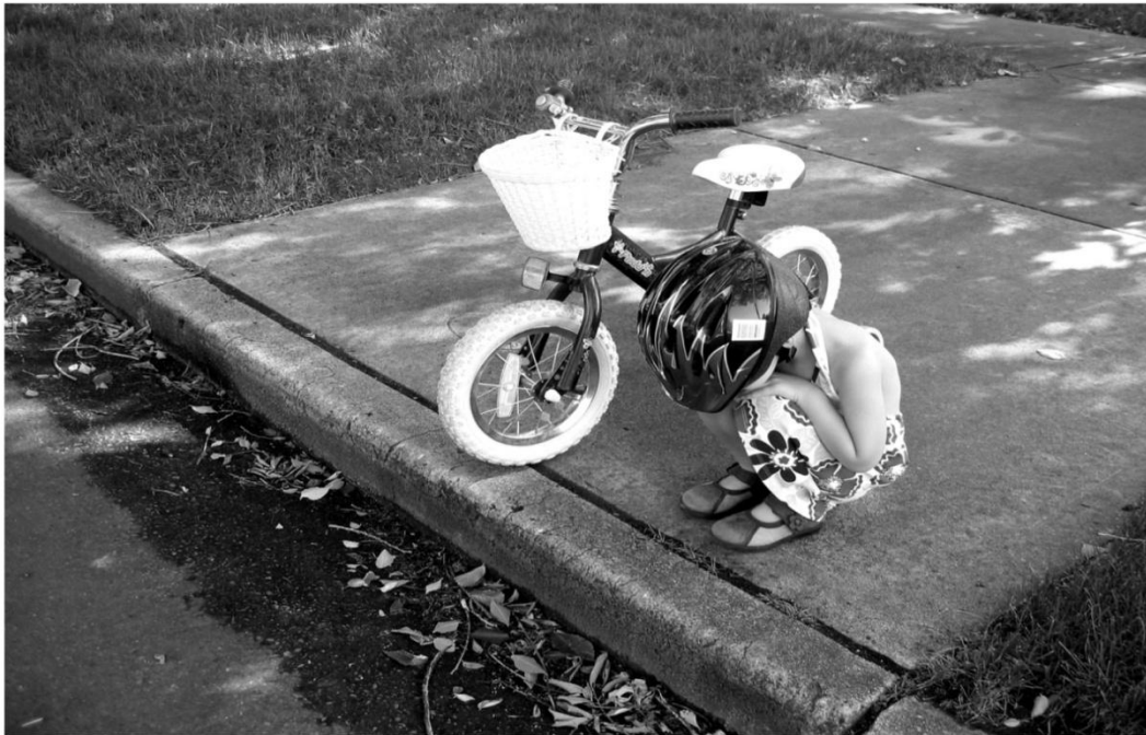
Nina Kuhl, Park Hill parent 5 years (2006)

The lack of a sidewalk ramp makes it difficult for the little girl to cross the street. Sidewalks like this are the norm in Park Hill, so it's a challenge to push a stroller, ride a bike, or use a wheel chair.