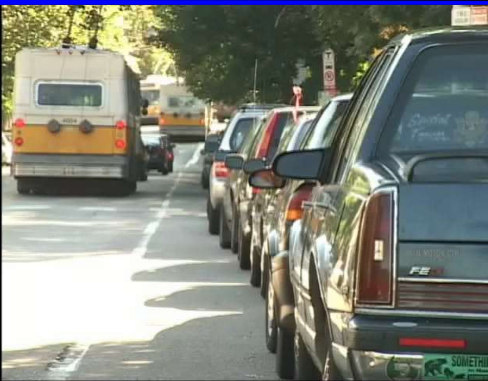
VIDEO: Avoiding the door zone