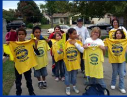
2 nd Annual Sacramento Safe Routes to School 5 Es Conference November 12, 2010

Building and Funding a Sustainable Safe Routes Program